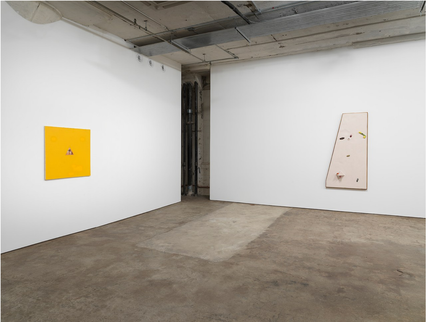
“Paranoid Crucible”, 2020