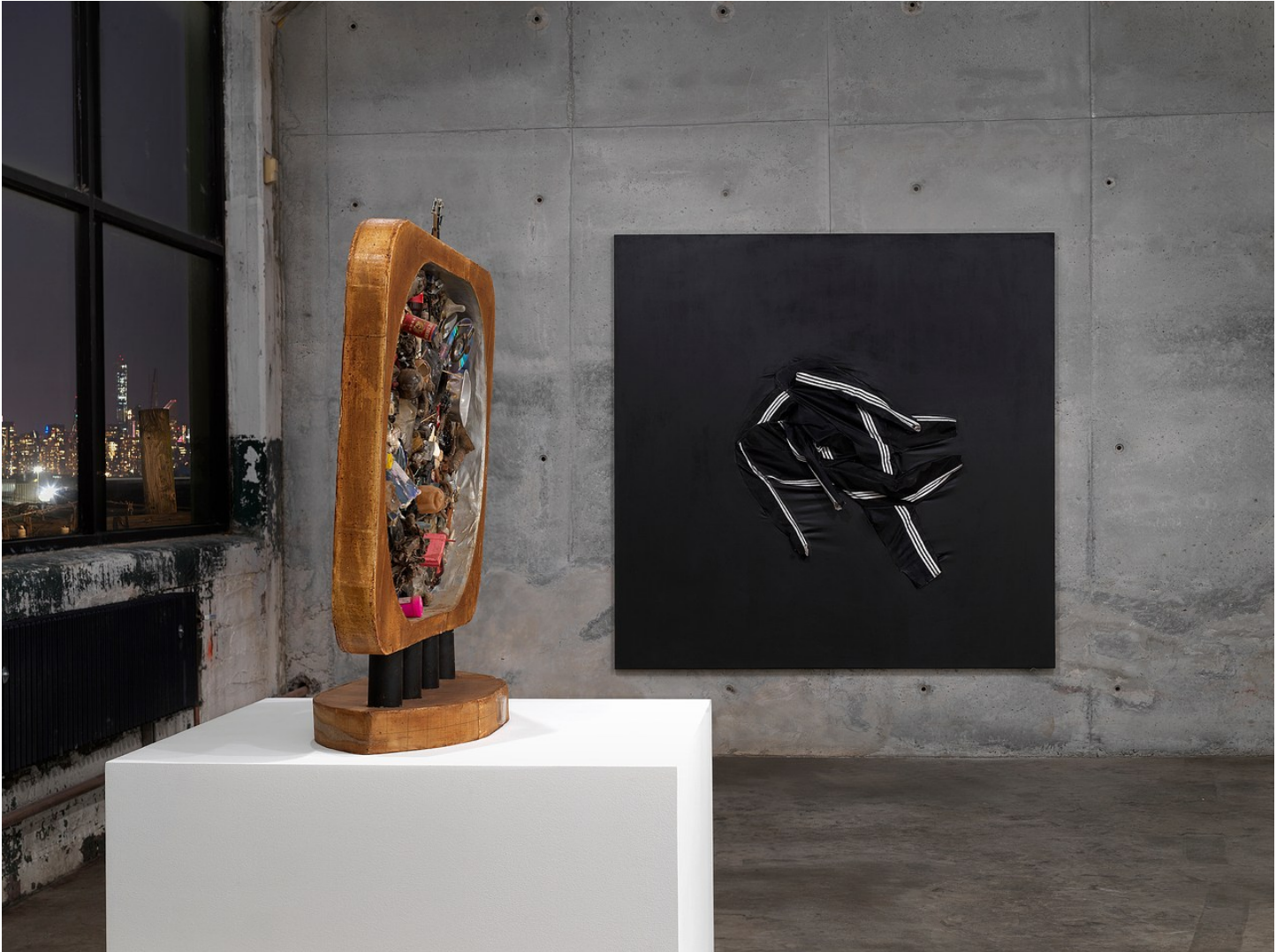
“Paranoid Crucible”, 2020