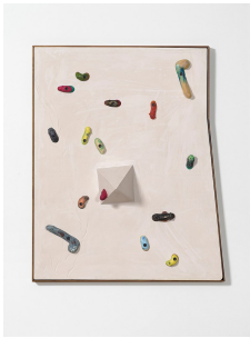
Andra Ursuta Untitled (fragment from "Alps") , 2016 Aqua resin, urethane, and hardware in artist's frame 46 1/2 x 35 1/2 x 3 inches (118 cm x 90 x 8 cm)