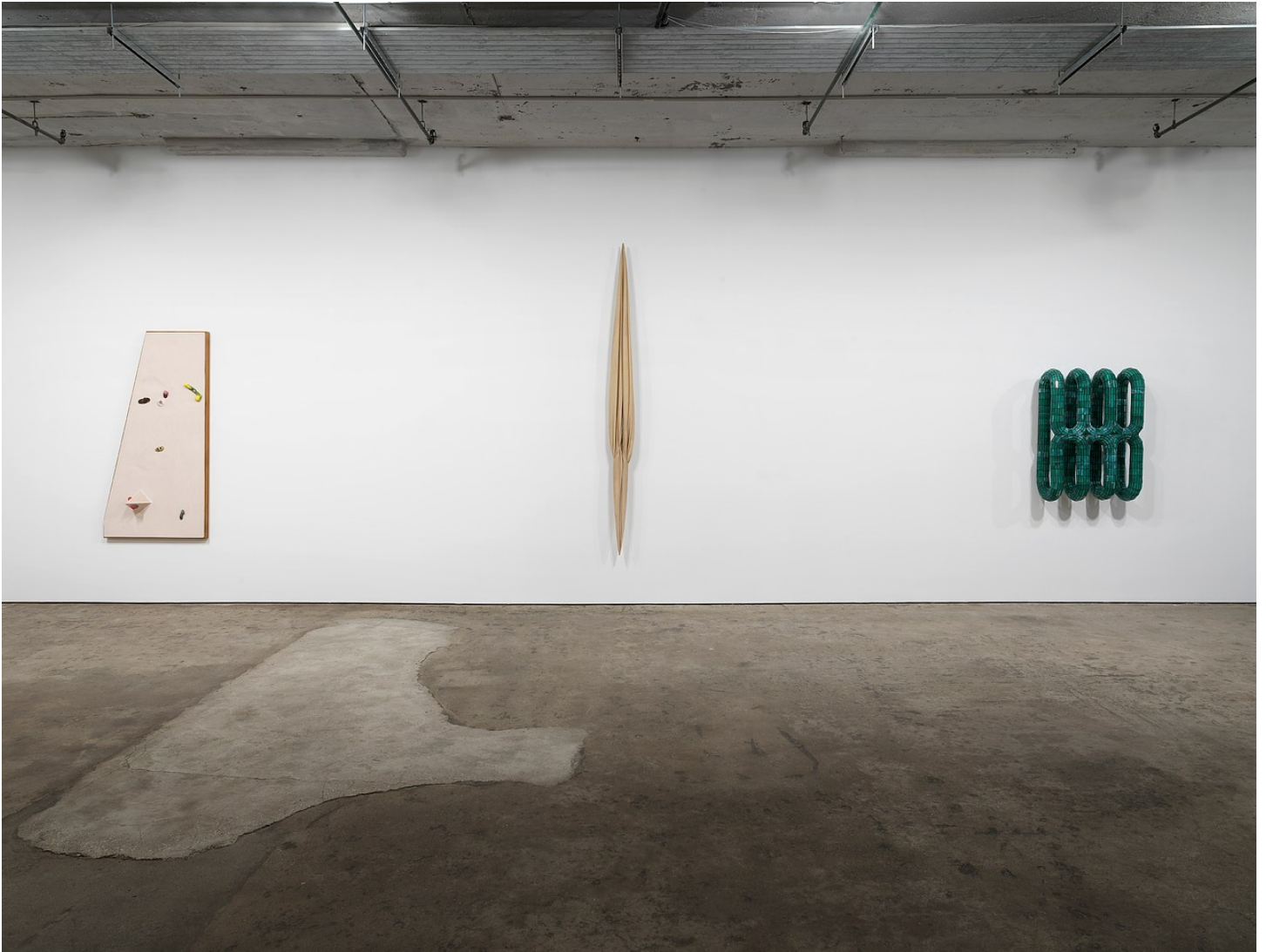
“Paranoid Crucible”, 2020