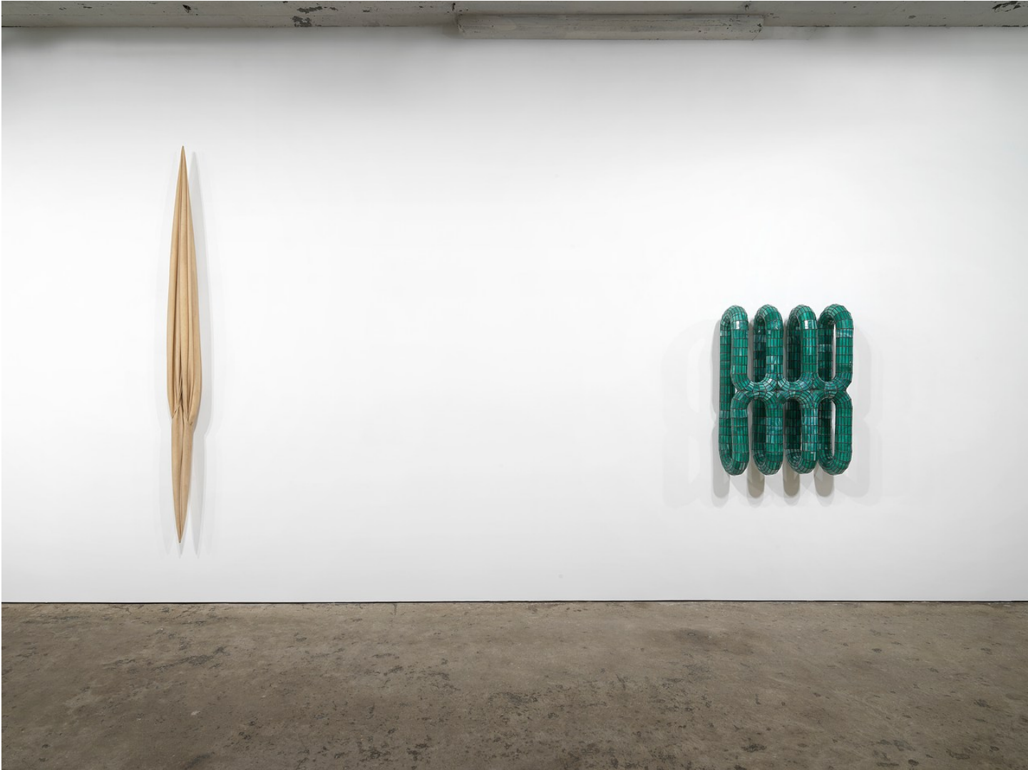
“Paranoid Crucible”, 2020