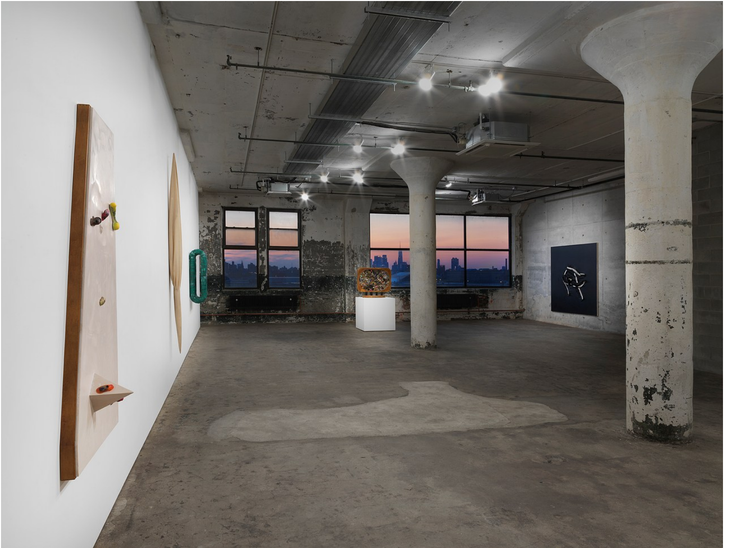
“Paranoid Crucible”, 2020