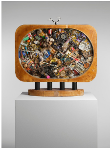
Jean Katambayi Mukendi Naufrage, 2018 Cardboard, paint, pencil, pen, trash 34 x 39.5 x 12 inches (86.5 x 100.5 x 30.5 cm)