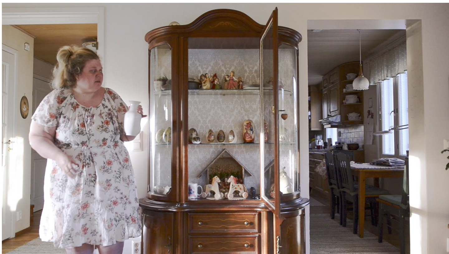
Iiu Susiraja Vitriini (Vitrine) , 2017 Video 1:04 2 of 3 + 1AP