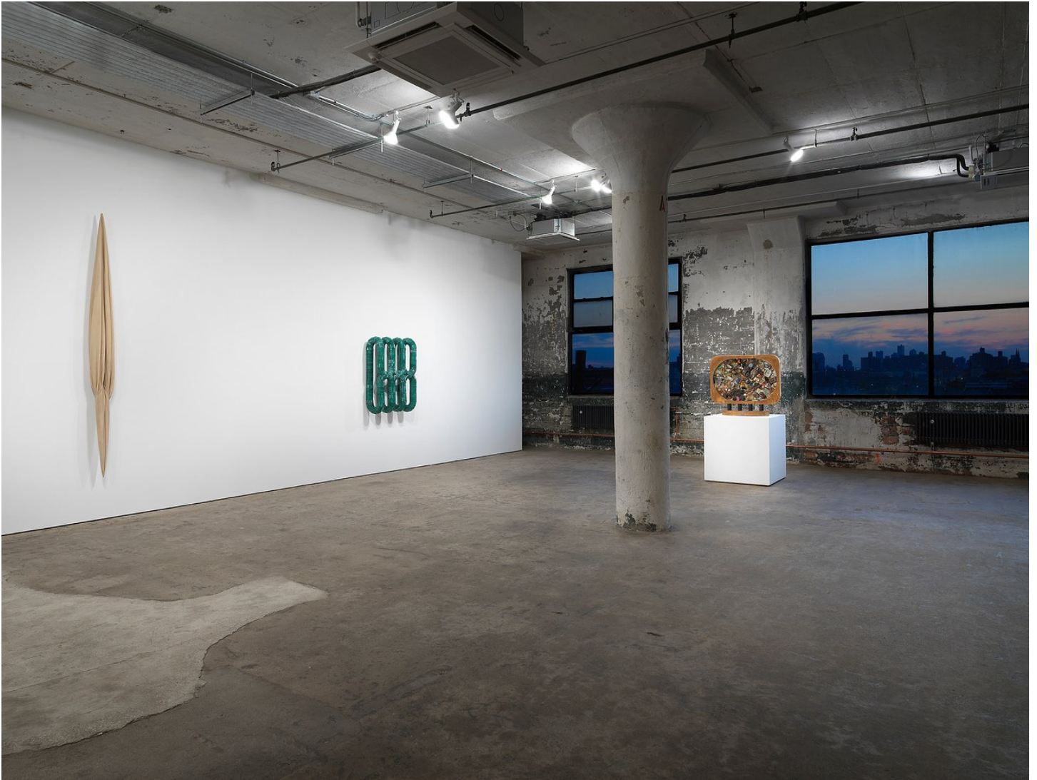
“Paranoid Crucible”, 2020