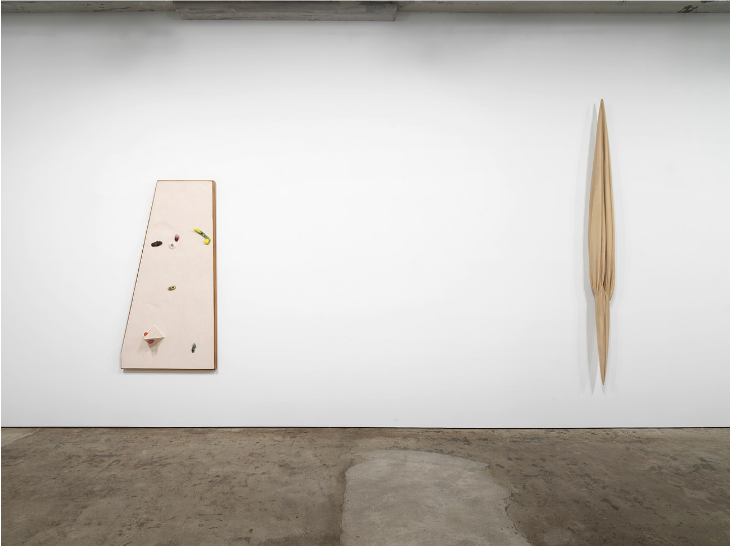
“Paranoid Crucible”, 2020