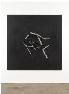
Sven Sachsalber Untitled, 2020 Arylic on canvas, thread 81 x 81 x 5 inches (206 x 206 x 13 cm)