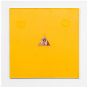
Phillip John Velasco Gabriel Untitled, 2020 Oil and acrylic on canvas 36 x 36 x 3/4 inches (91.4 x 91.4 x 2 cm)