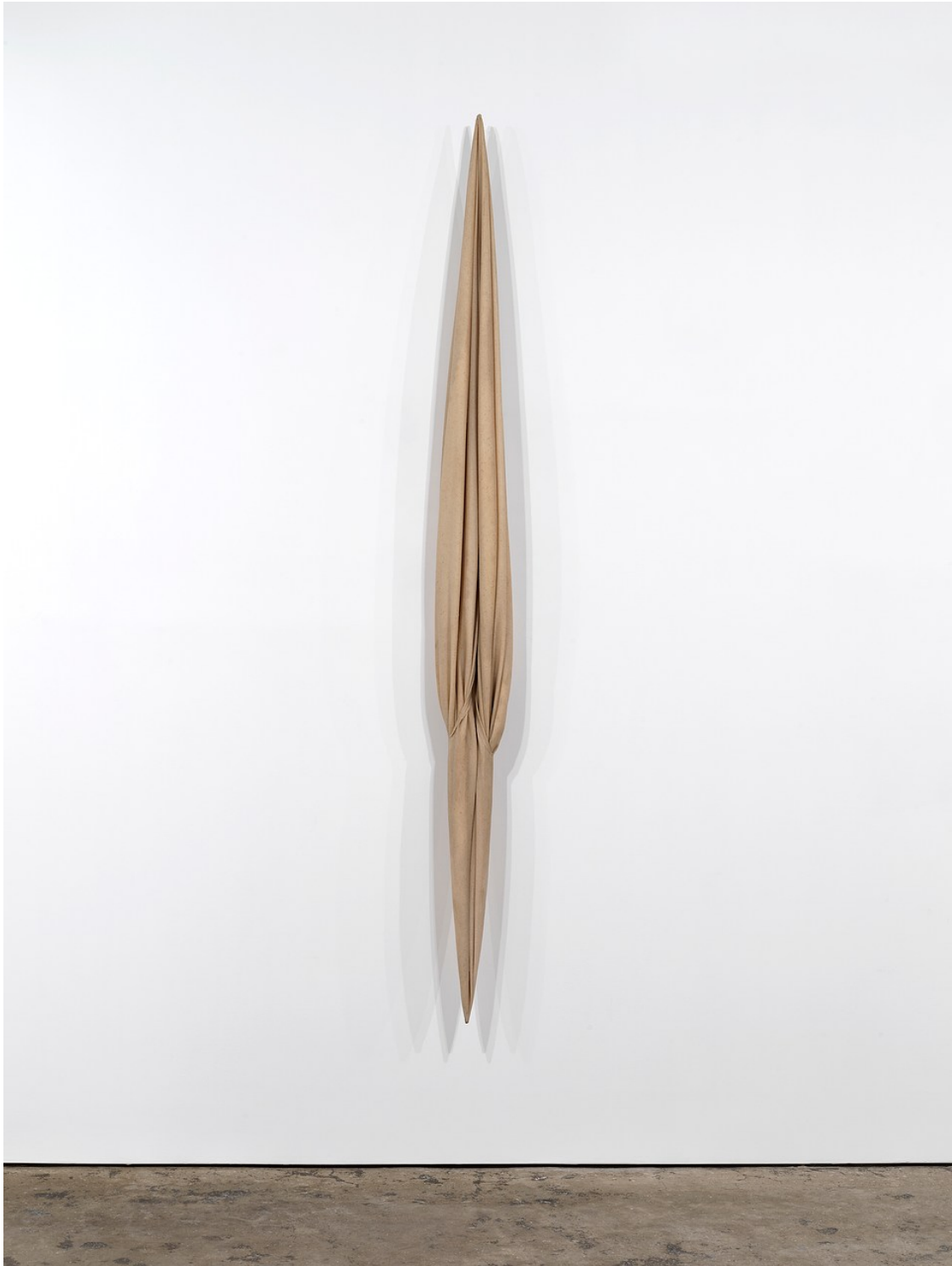
Eli Ping Mote , 2020 Cotton and UV resistant urethane resin 108 x 10 x 7 inches (274 x 25 x 18 cm)