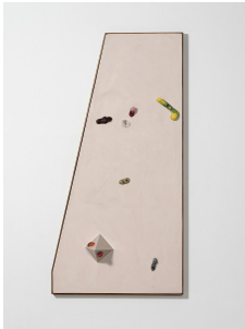
Andra Ursuta Untitled (fragment from "Alps") , 2016 Aqua resin, urethane, and hardware in artist's frame 73 x 37 x 3 inches (188 x 94 x 8 cm)