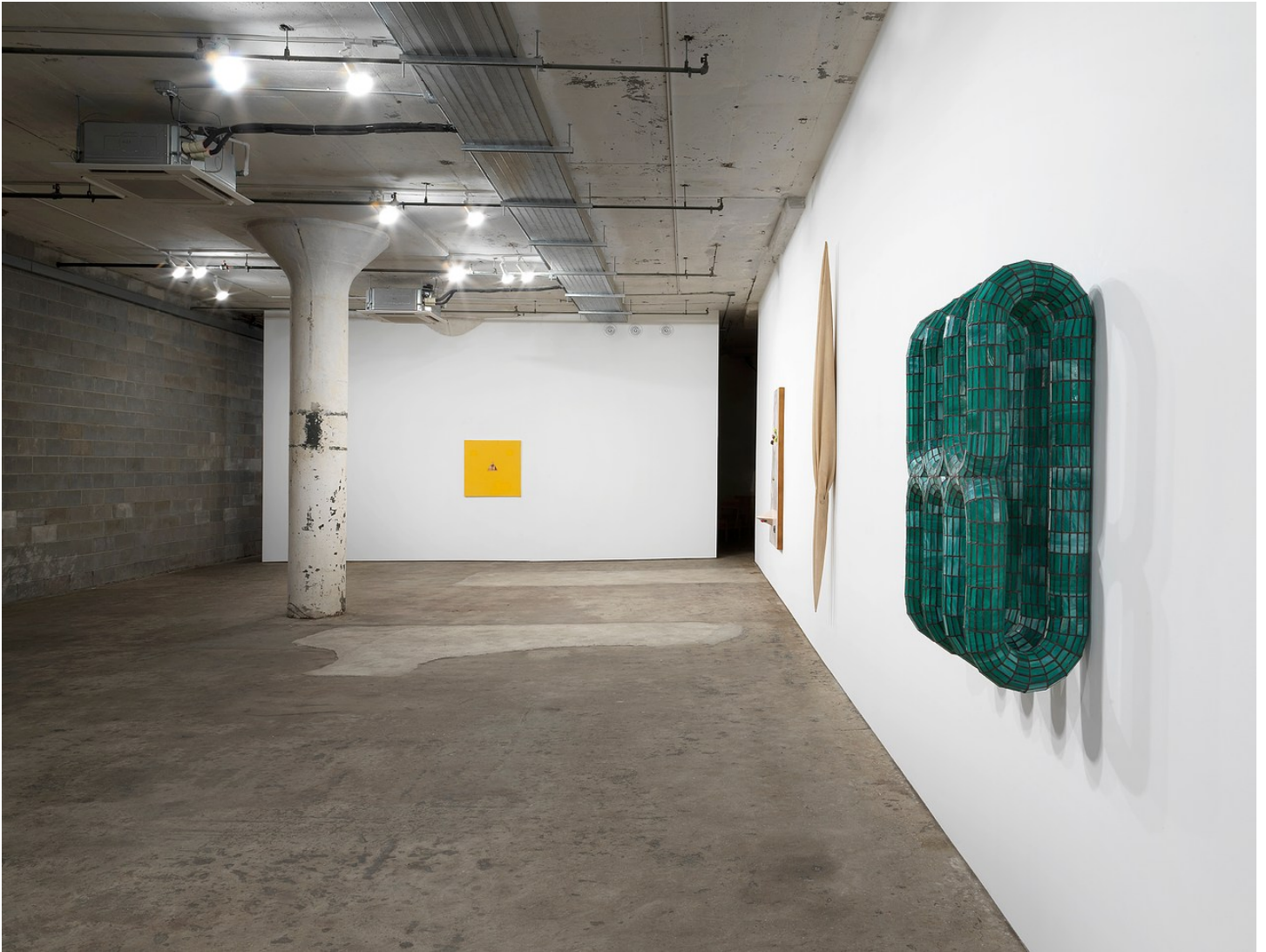
“Paranoid Crucible”, 2020