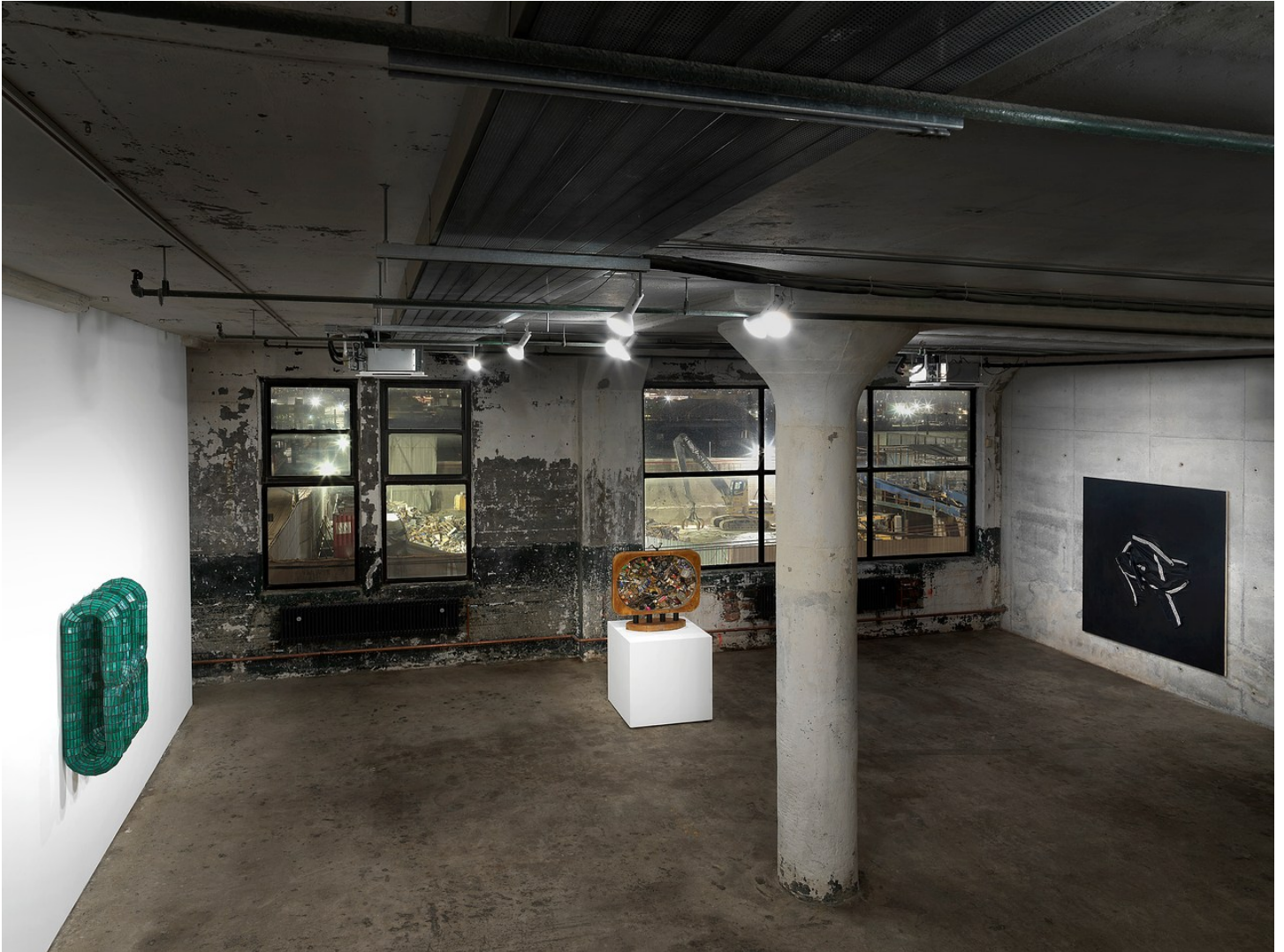
“Paranoid Crucible”, 2020