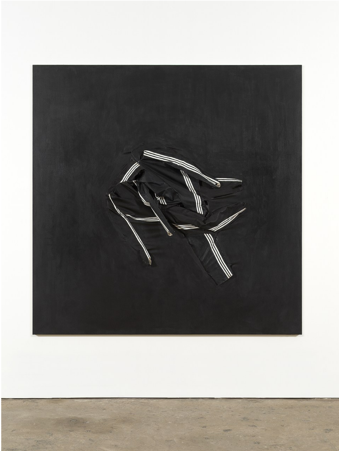
Sven Sachsälber Untitled , 2020 Arylic on canvas, thread 81 x 81 x 5 inches (206 x 206 x 13 cm)