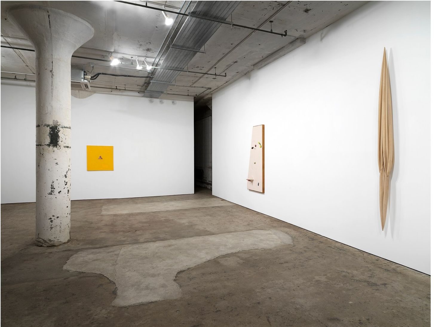
“Paranoid Crucible”, 2020