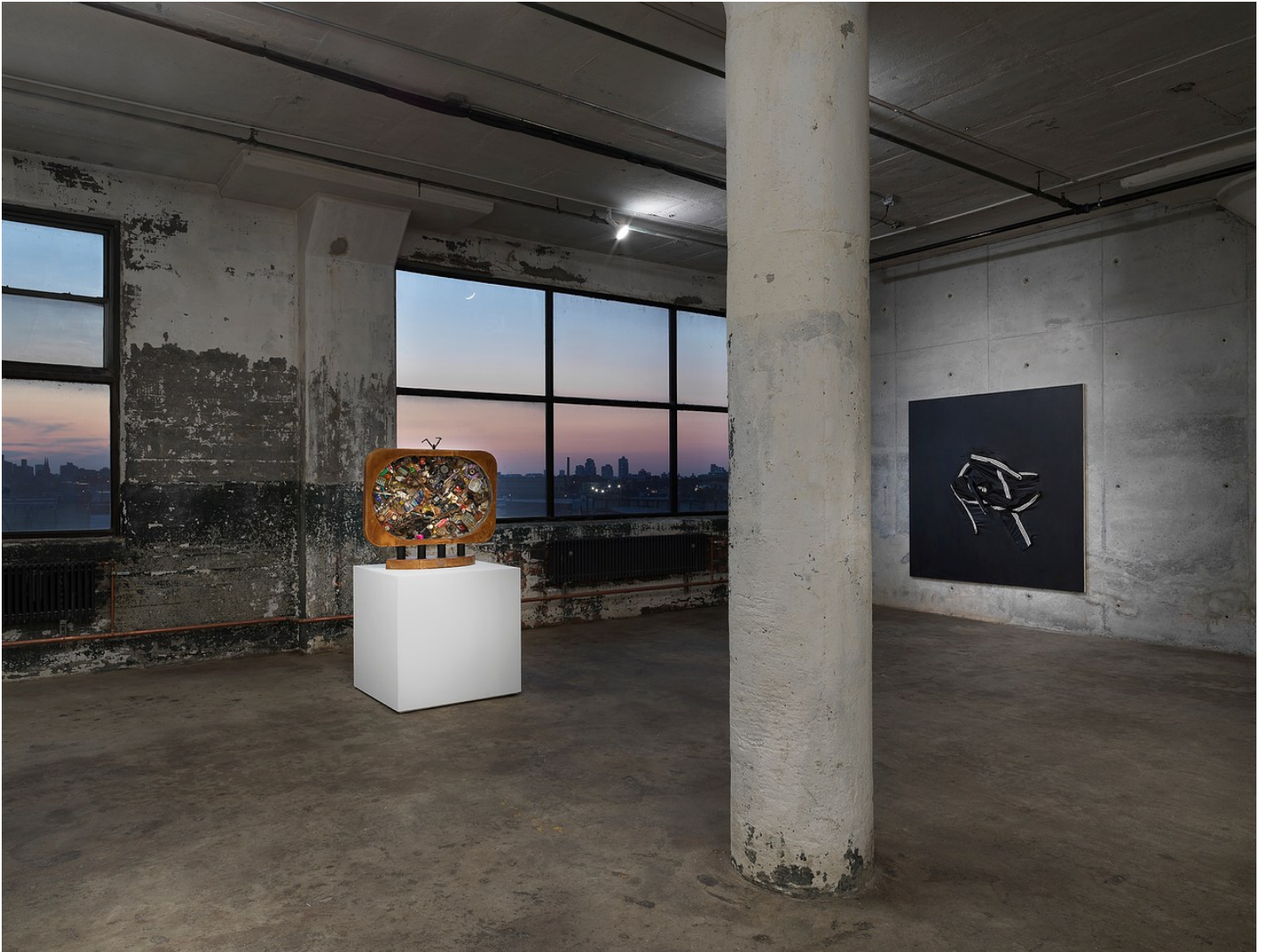
“Paranoid Crucible”, 2020