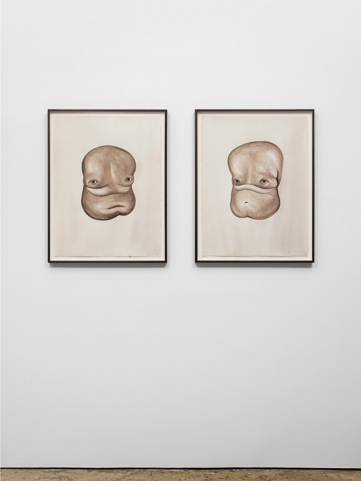
"Paranoid Crucible", 2020