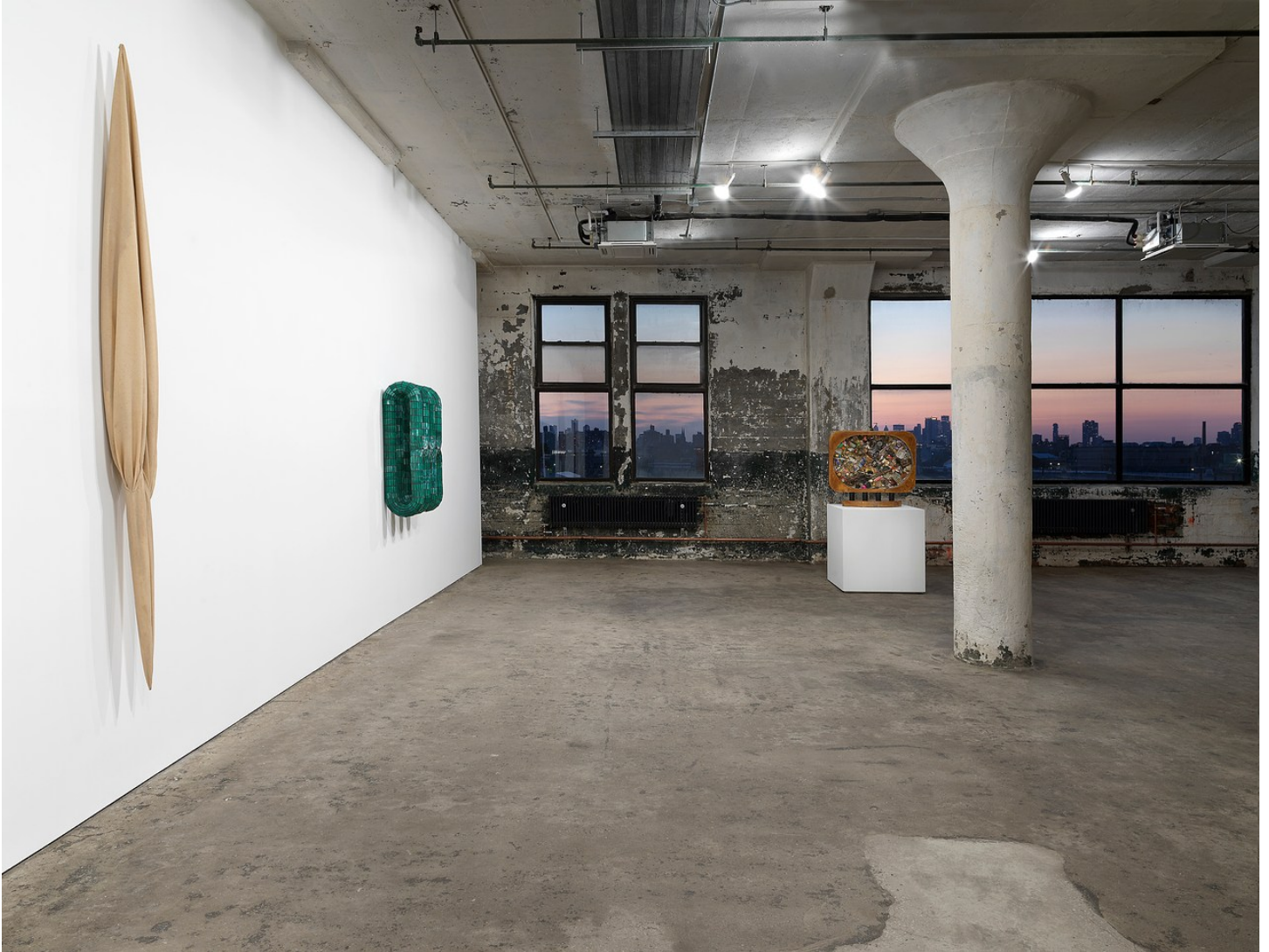
“Paranoid Crucible”, 2020