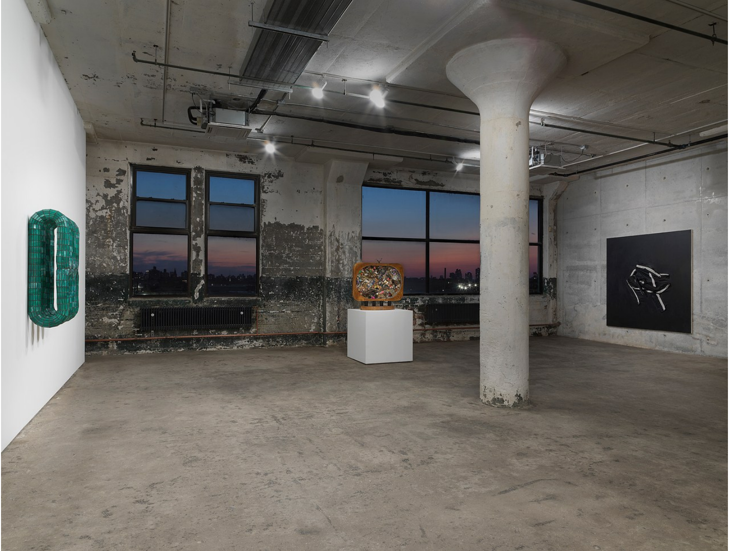
“Paranoid Crucible”, 2020