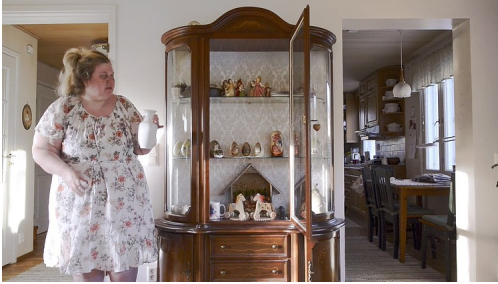
Iiu Susiraja Vitriini (Vitrine) , 2017 Video 1:04 2 of 3 + 1AP