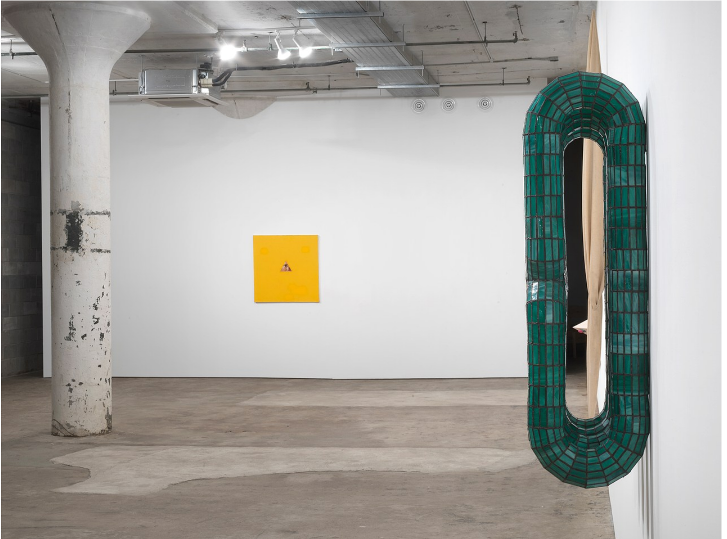
“Paranoid Crucible”, 2020