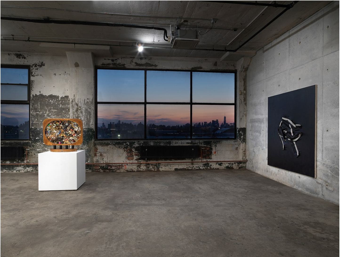
“Paranoid Crucible”, 2020