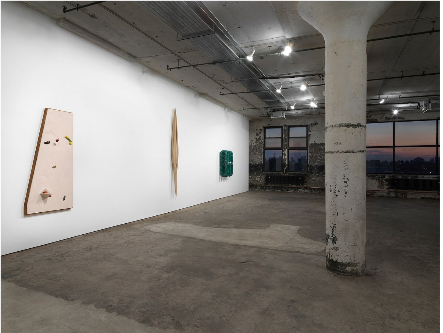
“Paranoid Crucible”, 2020