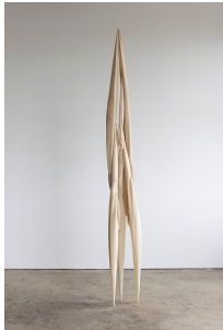
Eli Ping Monocarp , 2020 canvas and resin 120 x 16 x 11 inches