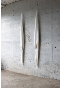
Eli Ping Mote (right) , 2020 cotton and resin 117 x 11 x 5 inches