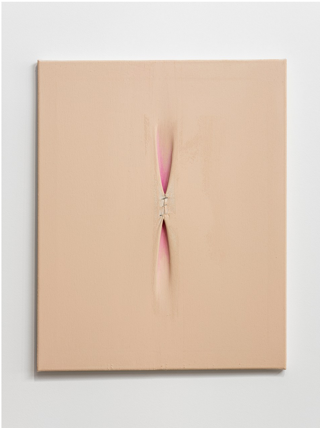
Eli Ping Untitled , 2021 oil on canvas, thread 24 x 19 x 1 inches