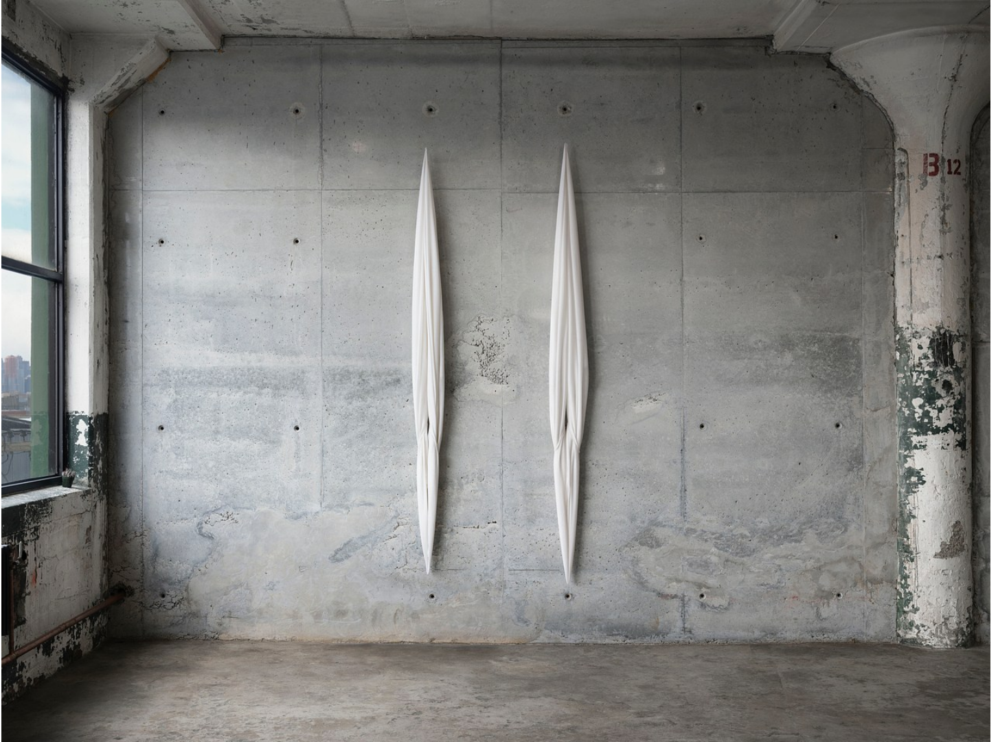
Eli Ping "B O N E", 2021