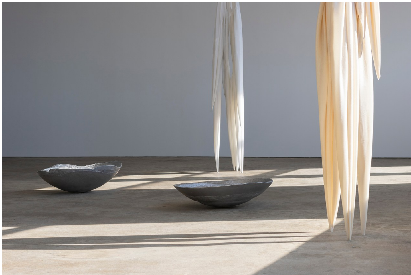
Eli Ping "B O N E", 2021