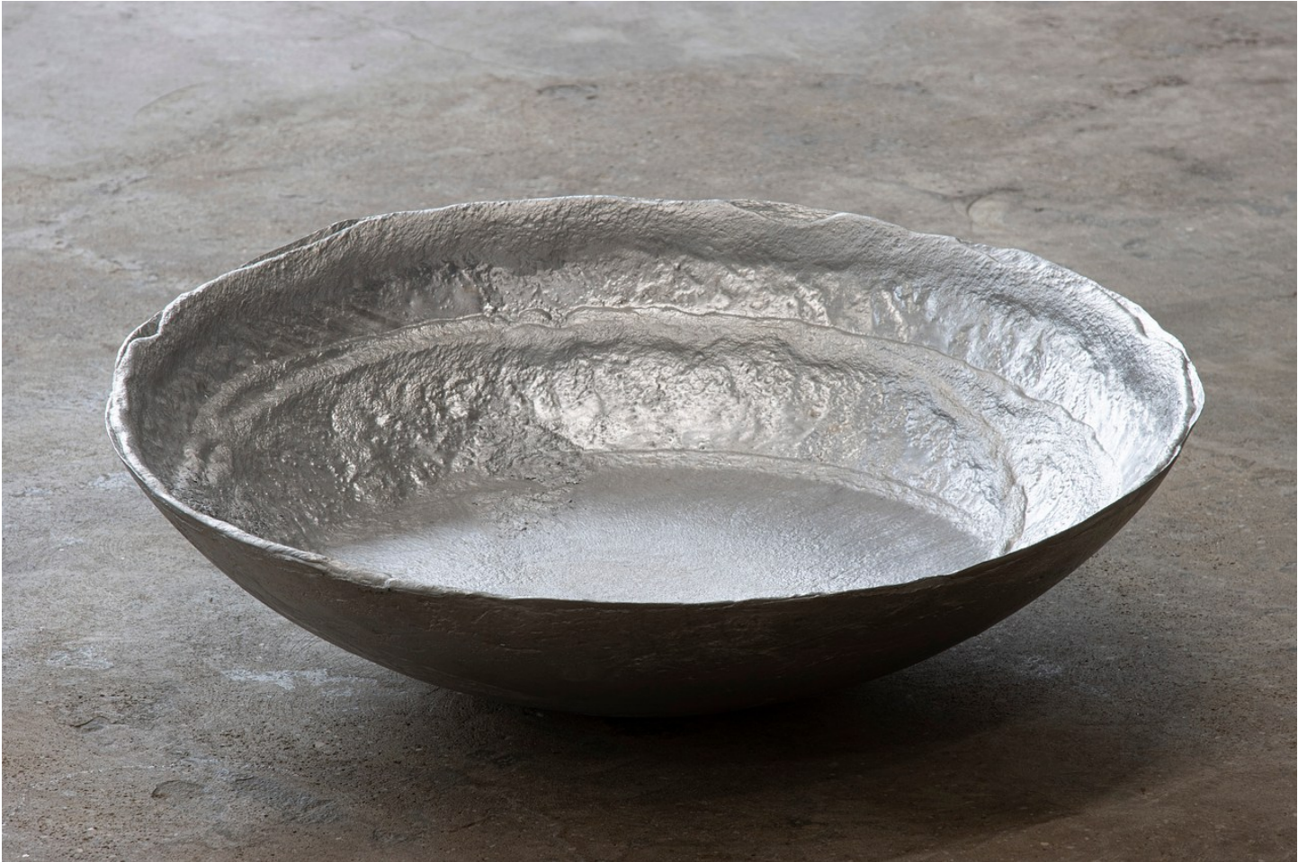
Eli Ping Untitled (5) , 2020 aluminum 10 x 29 x 29 inches