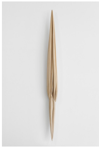
Eli Ping Mote , 2020 cotton and resin 108 x 10 x 7 inches (274 x 25 x 18 cm)