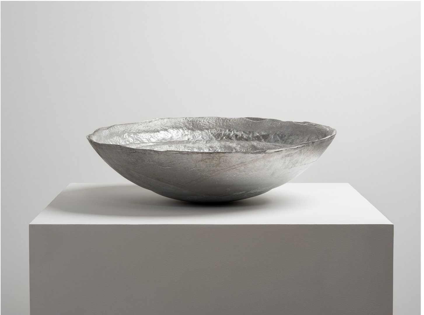
Eli Ping Untitled (5) , 2020 aluminum 10 x 29 x 29 inches