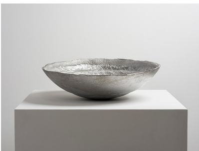
Eli Ping Untitled (5) , 2020 aluminum 10 x 29 x 29 inches