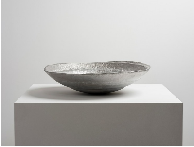
Eli Ping Untitled (2) , 2020 aluminum 7 x 27 x 27 inches