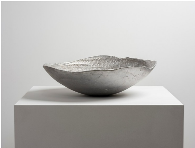
Eli Ping Untitled (7) , 2020 aluminum 10 x 29 x 29 inches