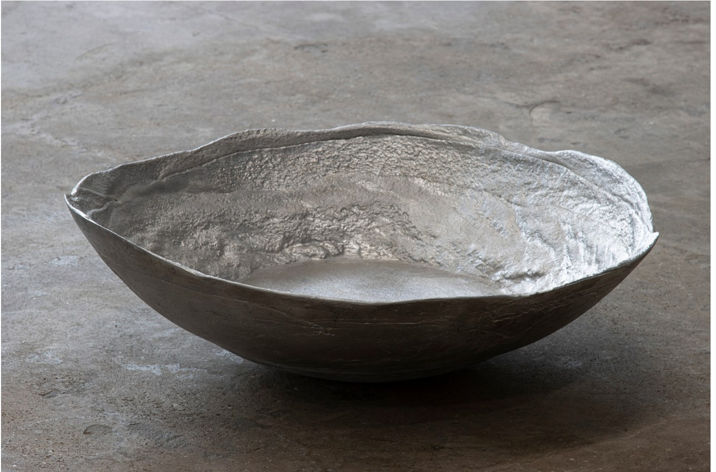
Eli Ping Untitled (6) , 2020 aluminum 10 x 29 x 29 inches