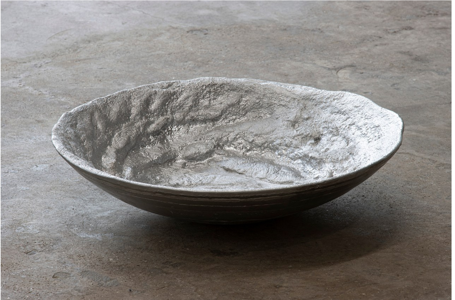
Eli Ping Untitled (1) , 2020 aluminum 7 x 27 x 27 inches