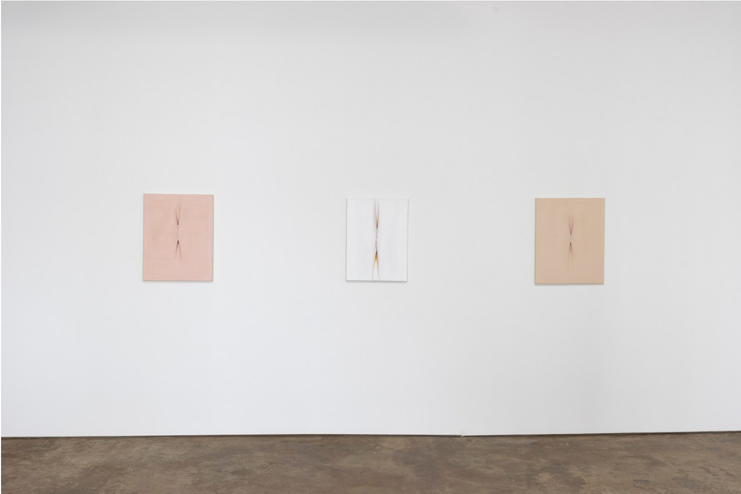
Eli Ping "B O N E", 2021