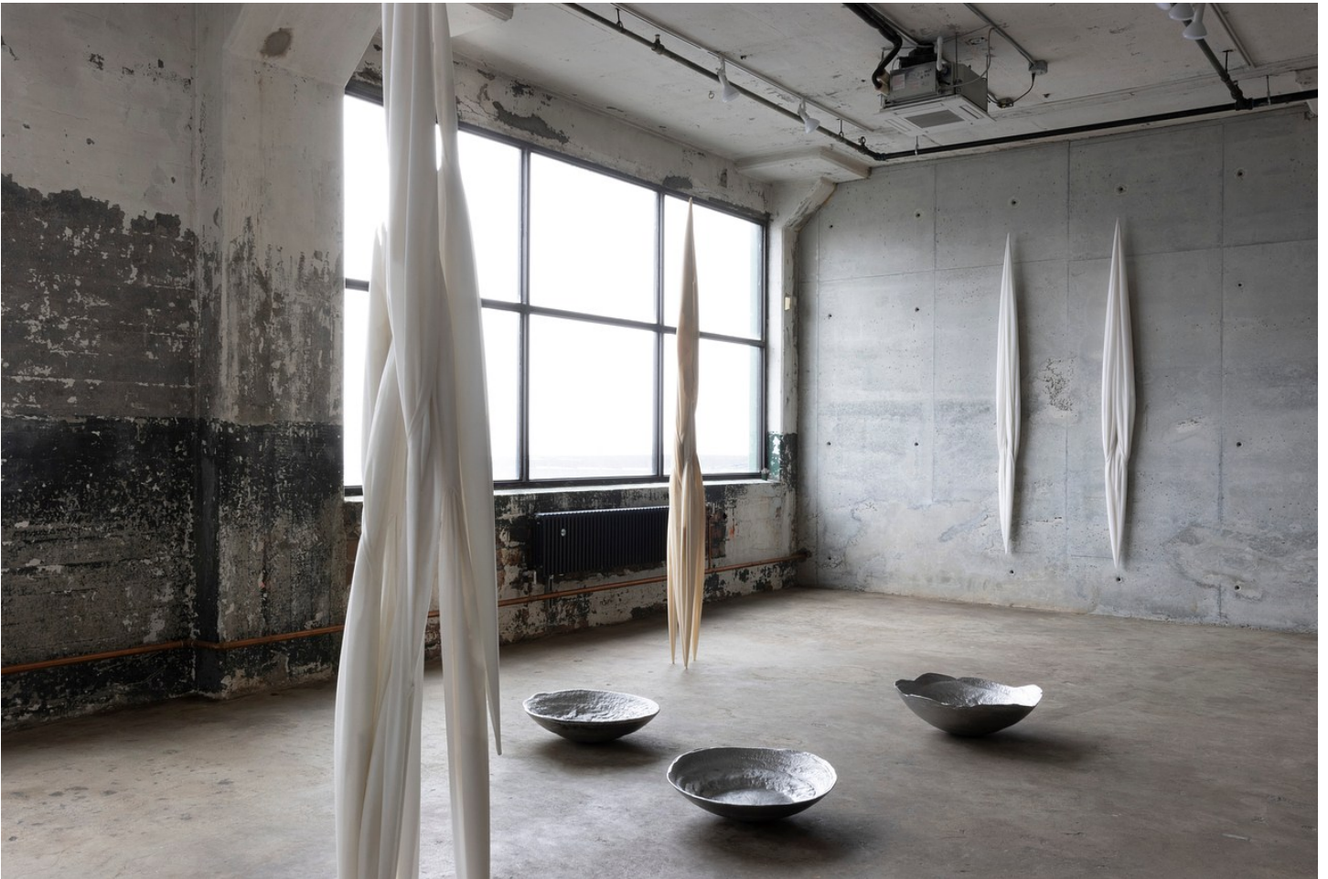
Eli Ping "B O N E", 2021