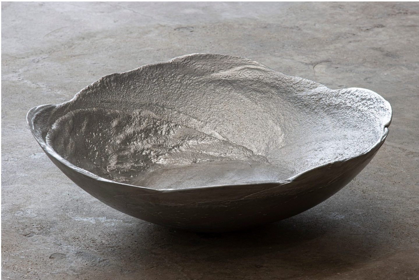
Eli Ping Untitled (3) , 2020 aluminum 10 x 29 x 29 inches