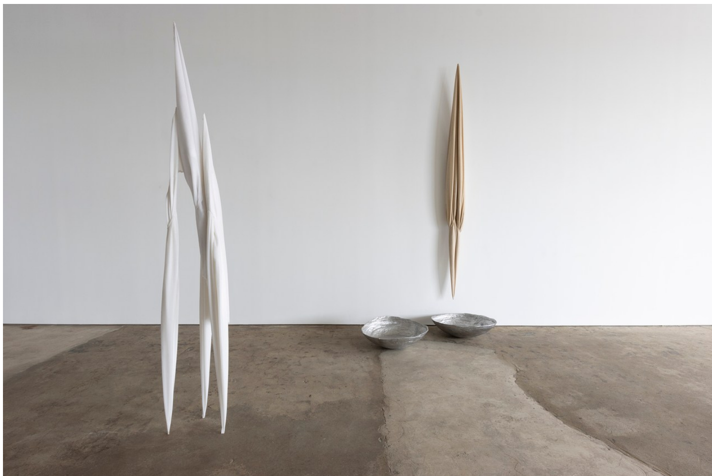
Eli Ping "B O N E", 2021