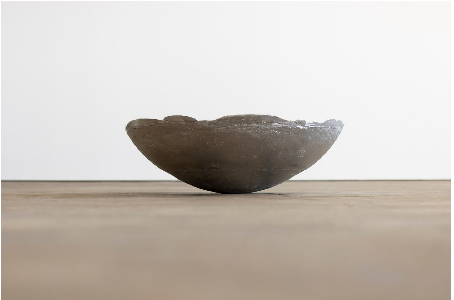
Eli Ping "B O N E", 2021