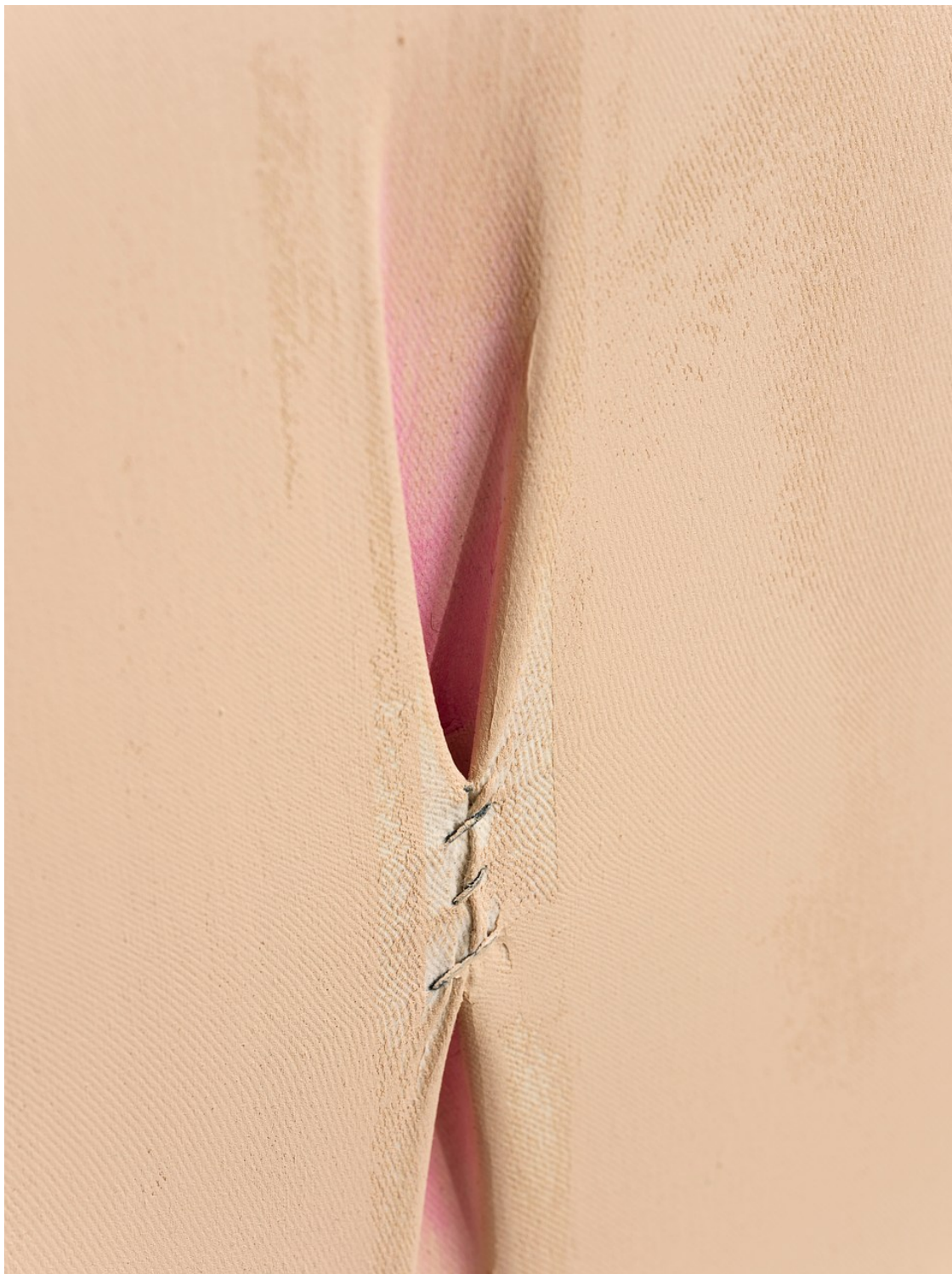
Eli Ping Untitled , 2021 oil on canvas, thread 24 x 19 x 1 inches