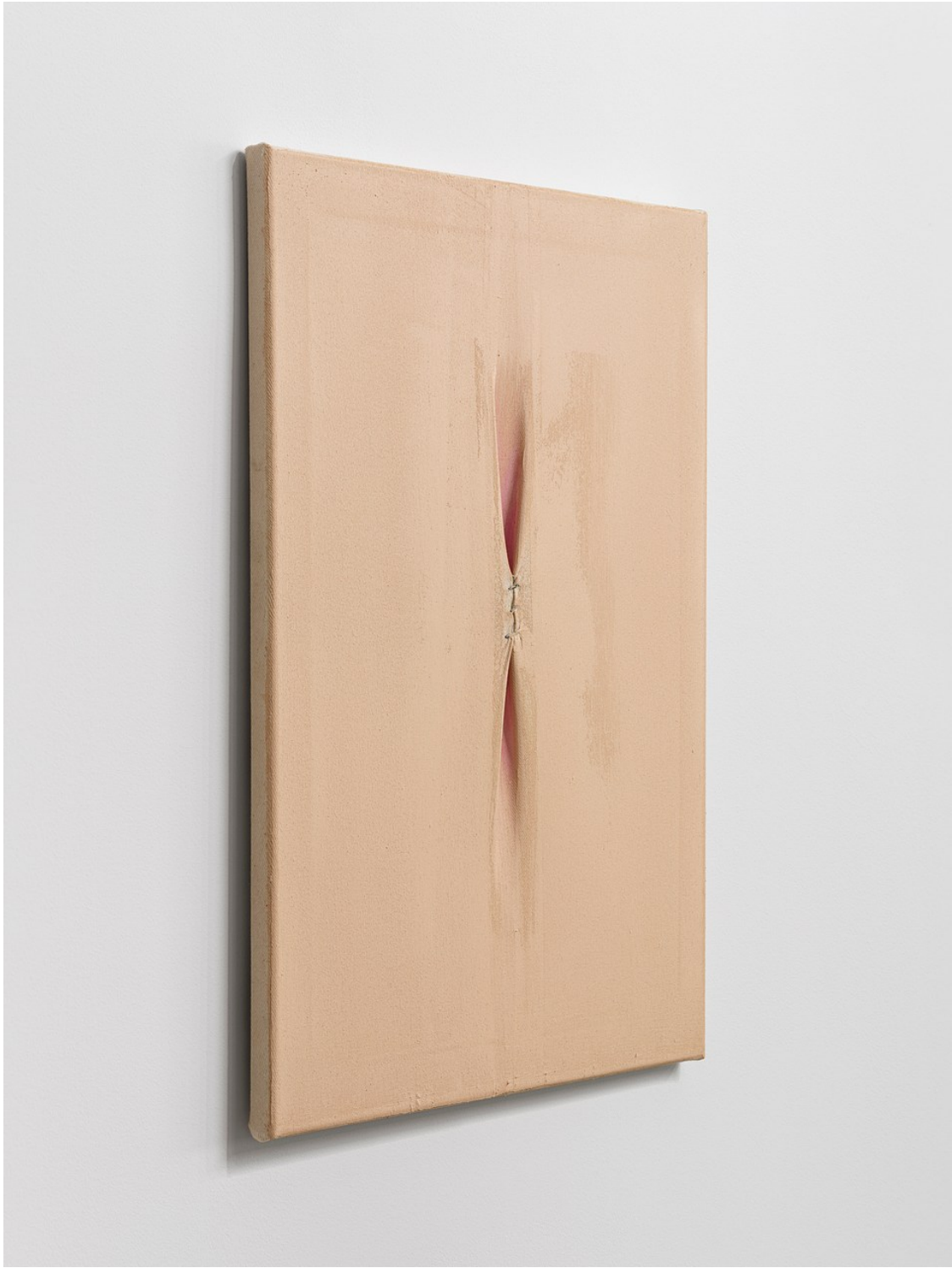
Eli Ping Untitled , 2021 oil on canvas, thread 24 x 19 x 1 inches