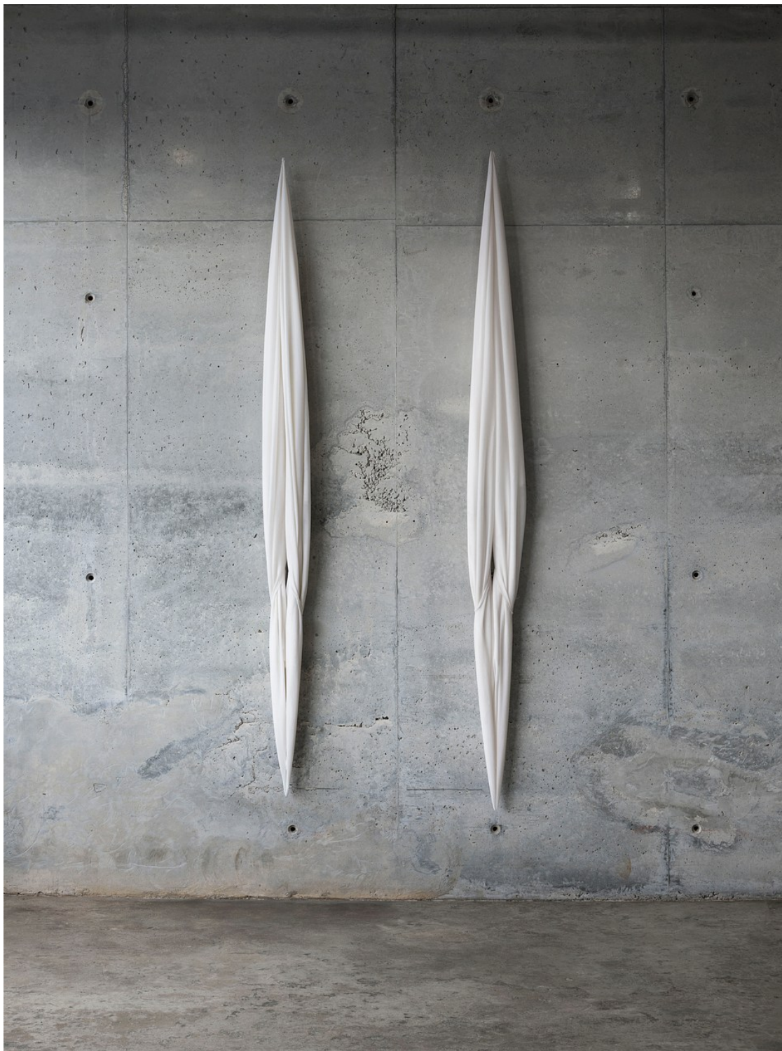
Eli Ping Mote (left) , 2020 cotton and resin 114 x 9 x 6 inches