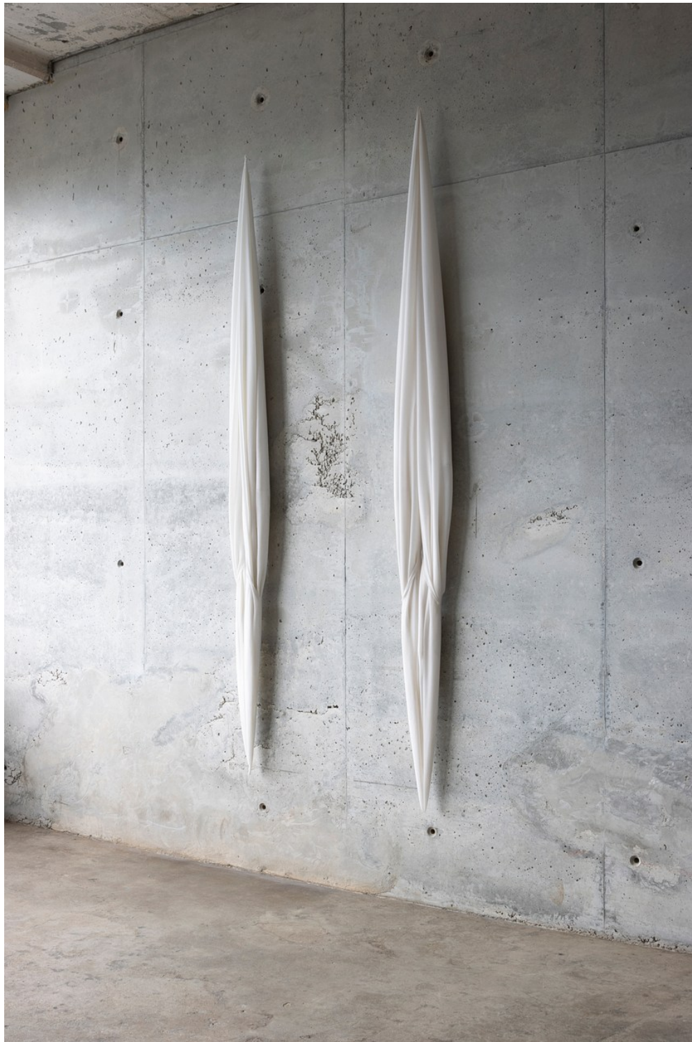
Eli Ping Mote (right) , 2020 cotton and resin 117 x 11 x 5 inches