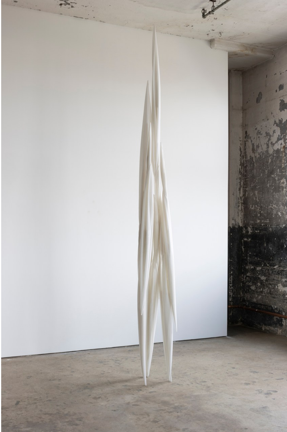
Eli Ping Monocarp , 2020 canvas and resin 140 x 16 x 13 inches