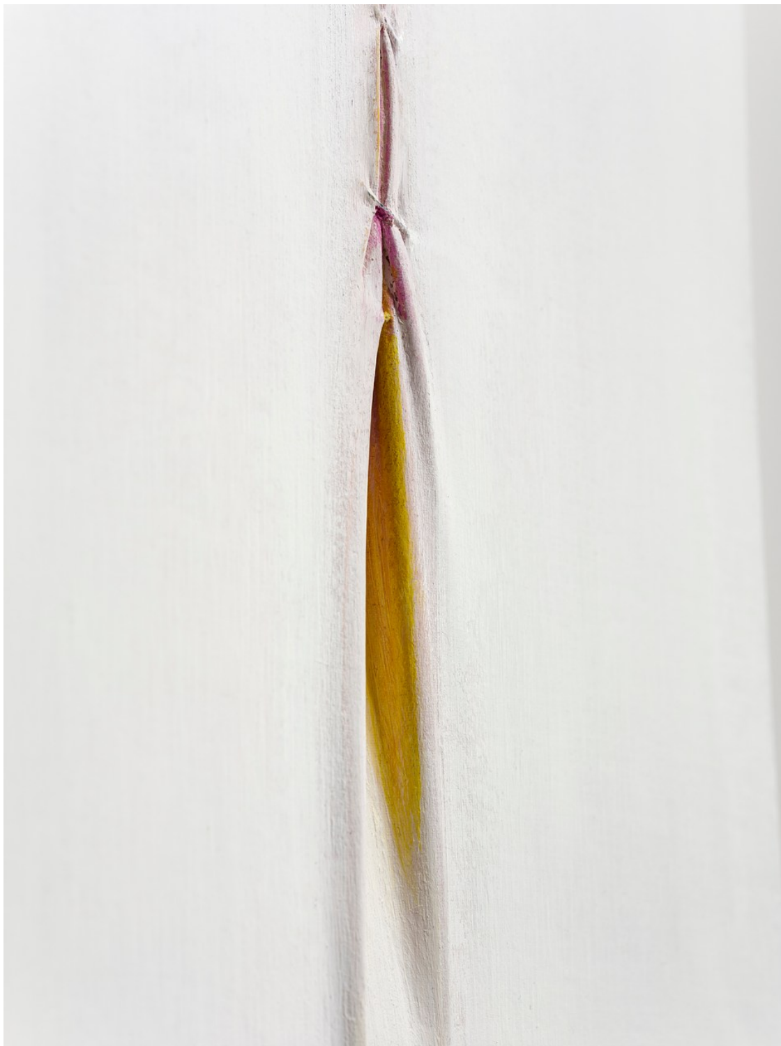
Eli Ping Untitled , 2021 oil on canvas, thread 23 x 17 x 1 inches