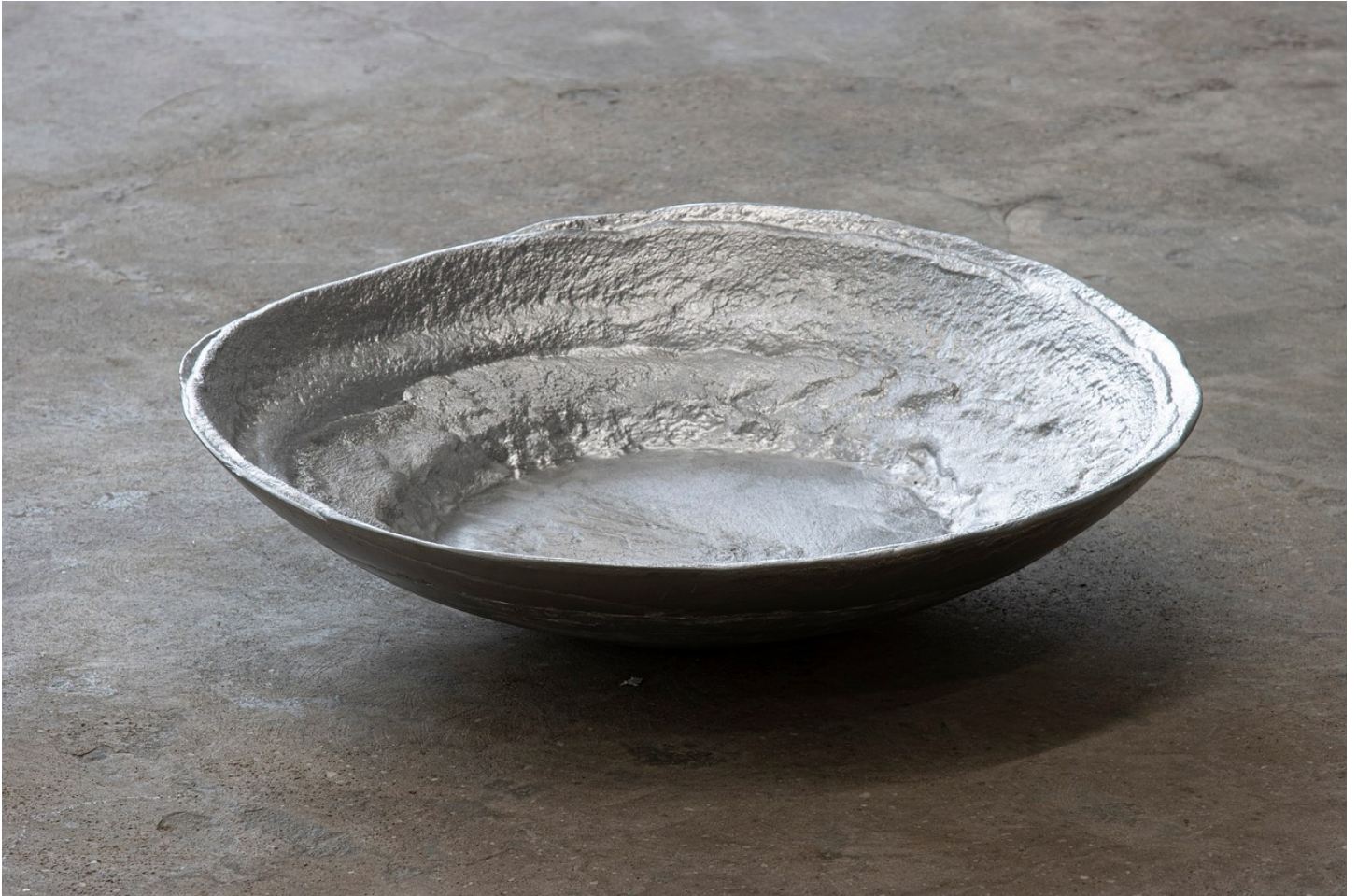
Eli Ping Untitled (2) , 2020 aluminum 7 x 27 x 27 inches