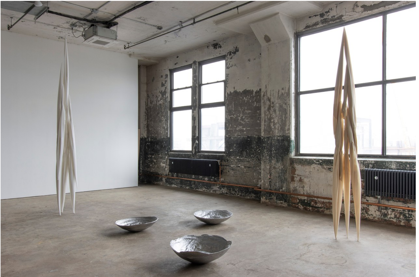
Eli Ping "B O N E", 2021