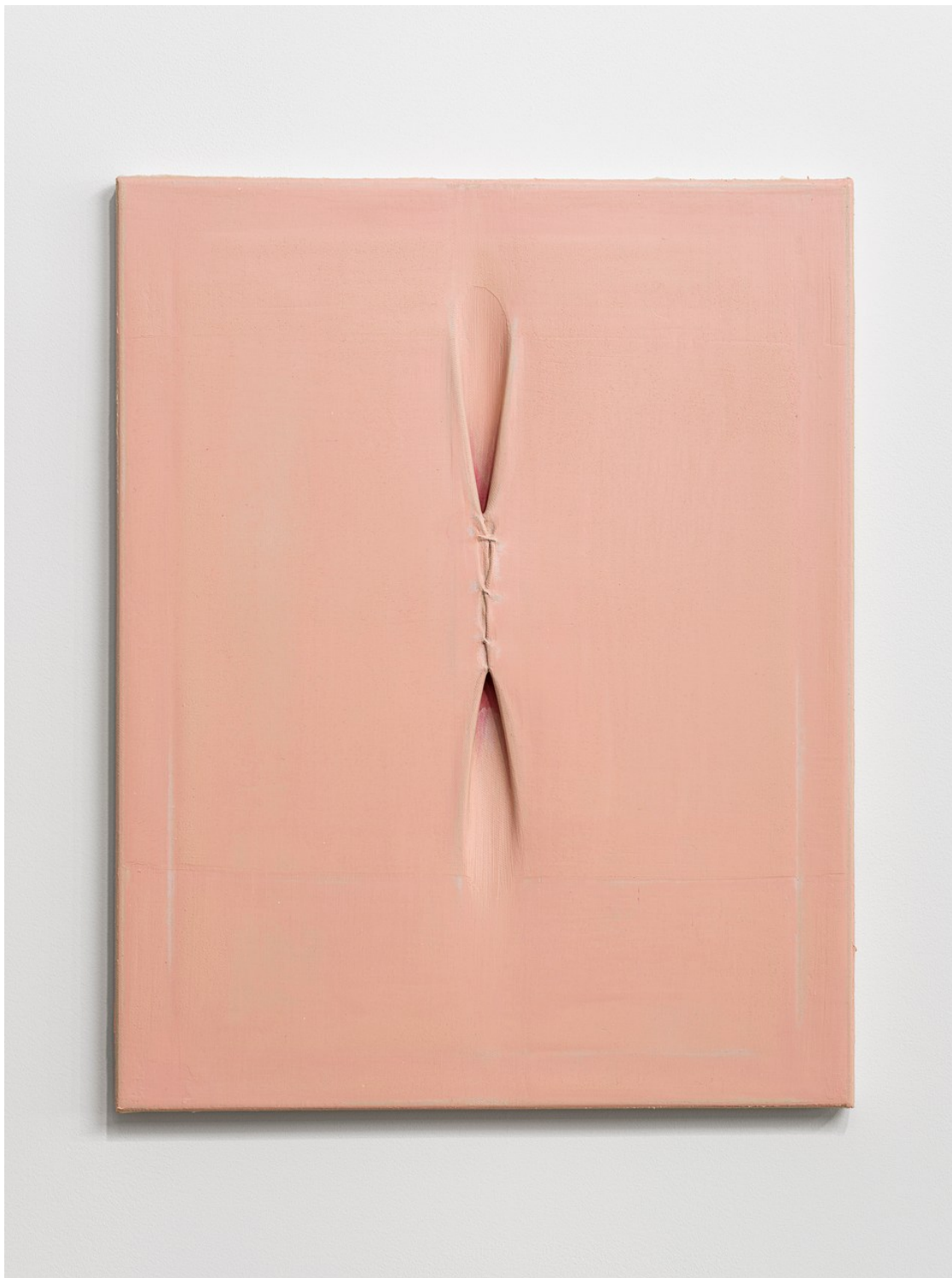
Eli Ping Untitled , 2021 oil on canvas, thread 24 x 19 x 1 inches