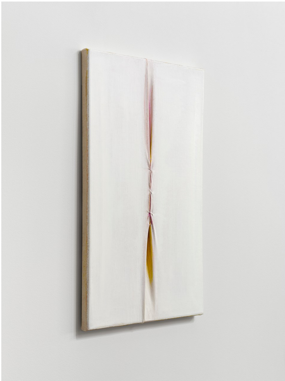
Eli Ping Untitled , 2021 oil on canvas, thread 23 x 17 x 1 inches