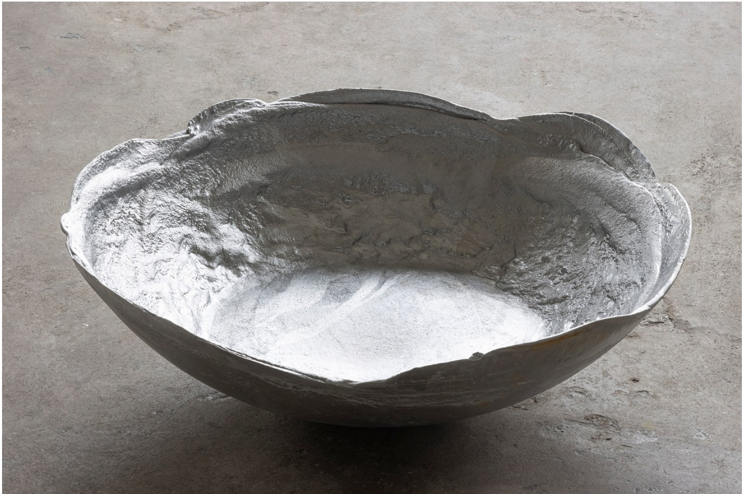
Eli Ping Untitled (4) , 2020 aluminum 10 x 29 x 29 inches