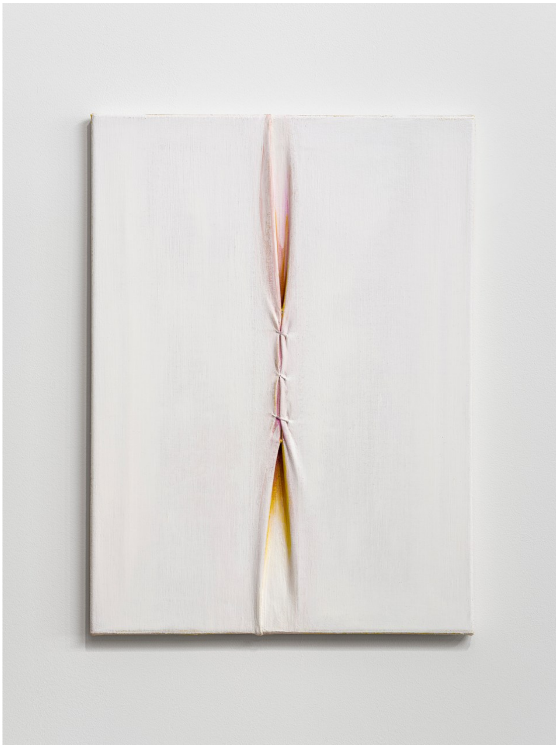
Eli Ping Untitled , 2021 oil on canvas, thread 23 x 17 x 1 inches