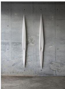
Eli Ping Mote (left) , 2020 cotton and resin 114 x 9 x 6 inches