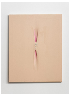
Eli Ping Untitled , 2021 oil on canvas, thread 24 x 19 x 1 inches