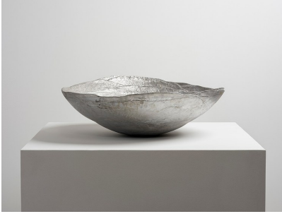
Eli Ping Untitled (6) , 2020 aluminum 10 x 29 x 29 inches