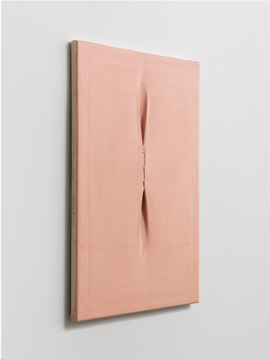
Eli Ping Untitled , 2021 oil on canvas, thread 24 x 19 x 1 inches