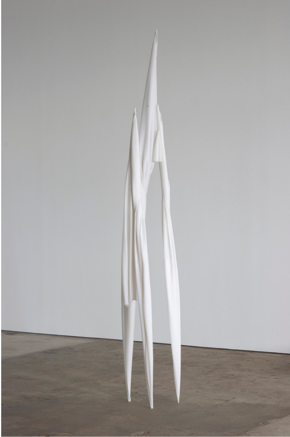
Eli Ping Monocarp , 2020 canvas and resin 100 x 17 x 10 inches