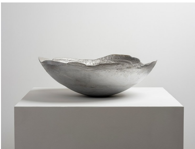
Eli Ping Untitled (4) , 2020 aluminum 10 x 29 x 29 inches