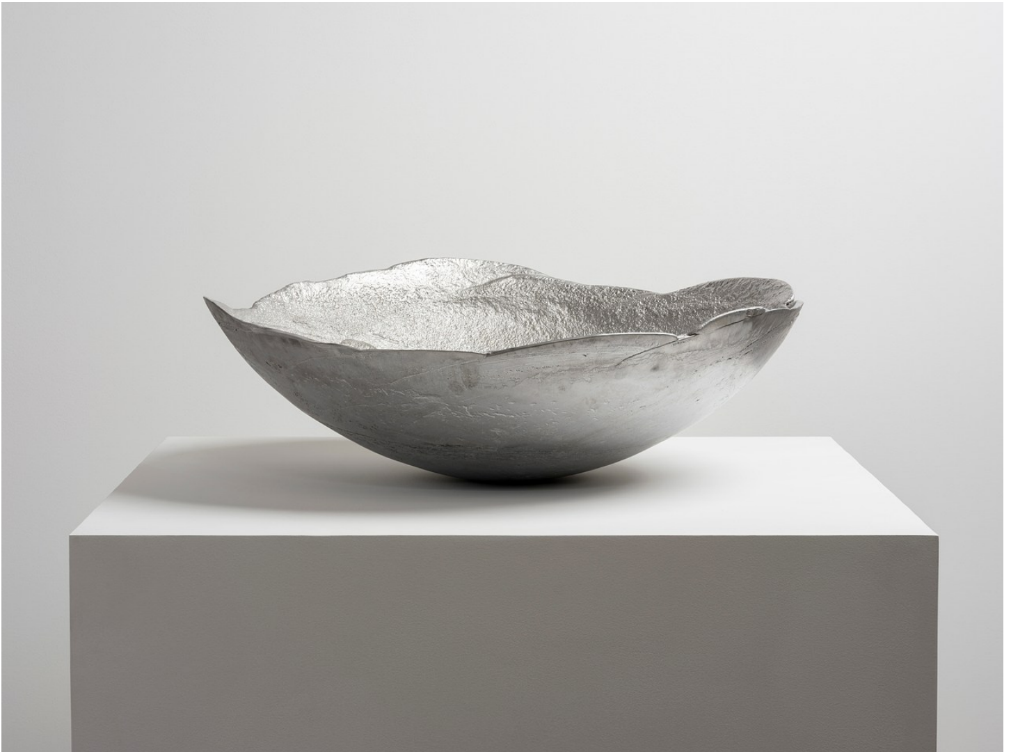
Eli Ping Untitled (3) , 2020 aluminum 10 x 29 x 29 inches