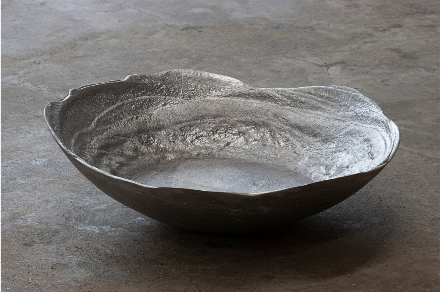
Eli Ping Untitled (7) , 2020 aluminum 10 x 29 x 29 inches