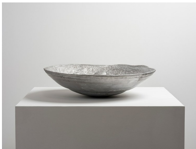
Eli Ping Untitled (1) , 2020 aluminum 7 x 27 x 27 inches